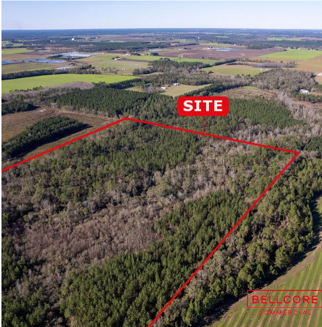
FOR SALE | SPORTSMAN'S PARADISE RETREAT