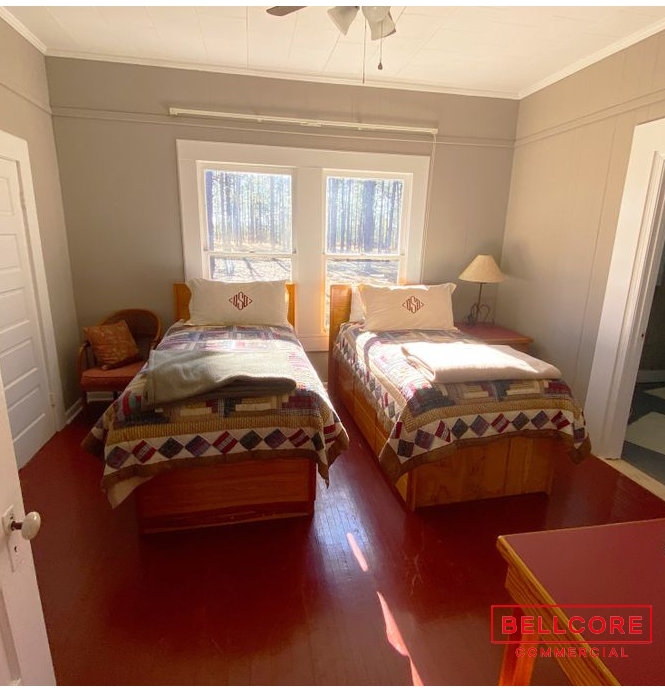
FOR SALE | SPORTSMAN'S PARADISE RETREAT