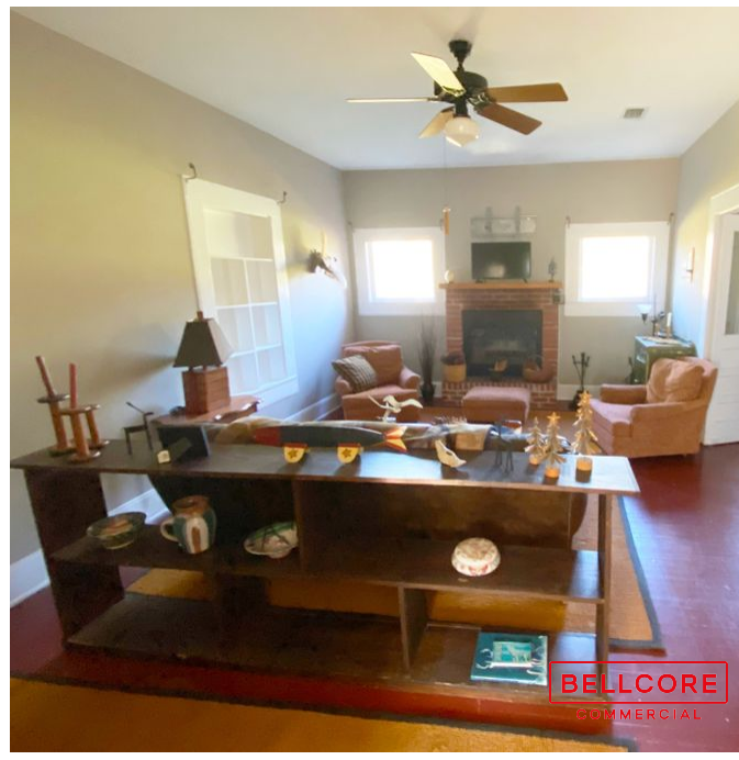
FOR SALE | SPORTSMAN'S PARADISE RETREAT