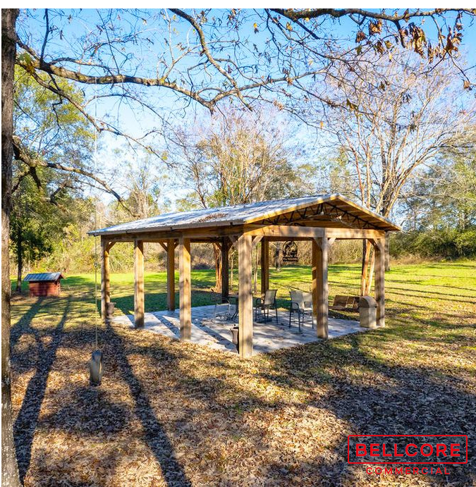
FOR SALE | SPORTSMAN'S PARADISE RETREAT