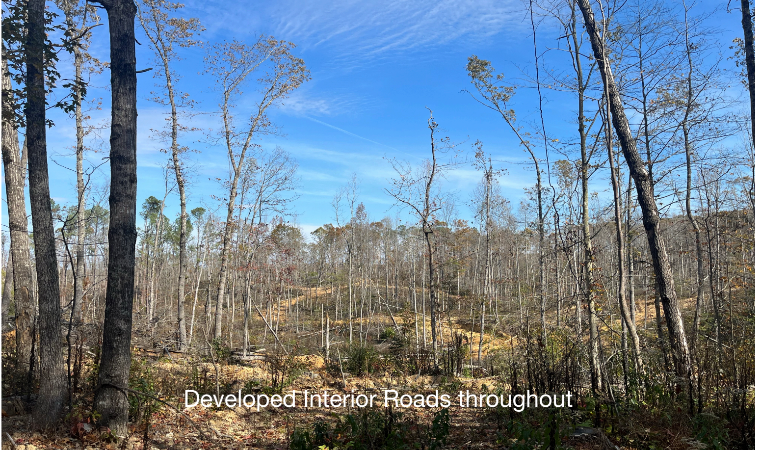
Developed Interior Roads throughout