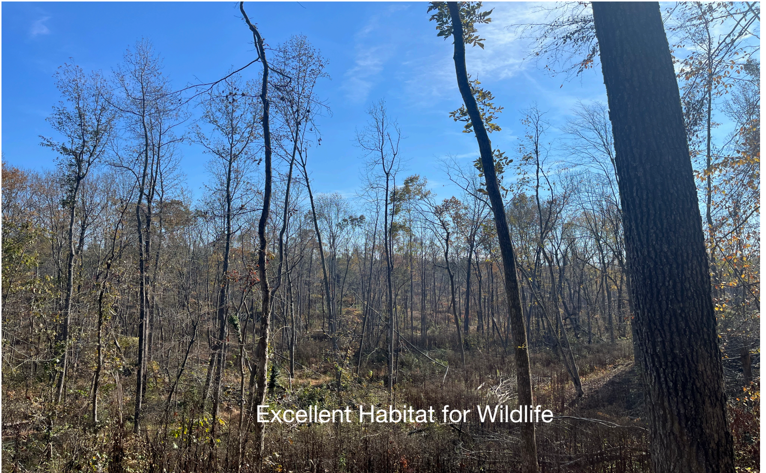
Excellent Habitat for Wildlife