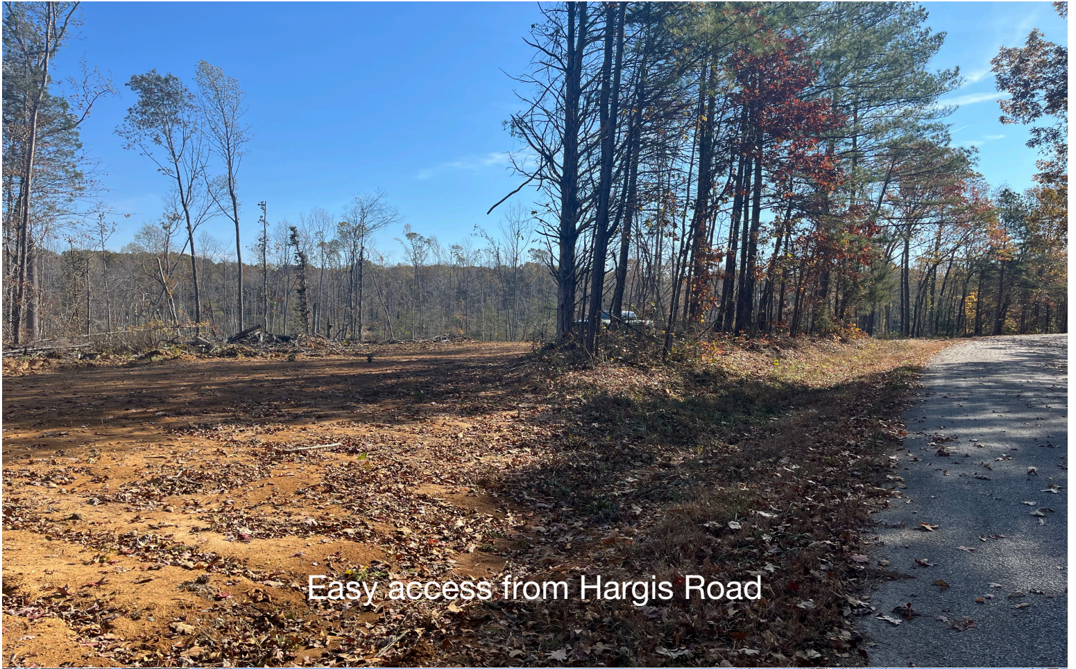
Easy access from Hargis Road