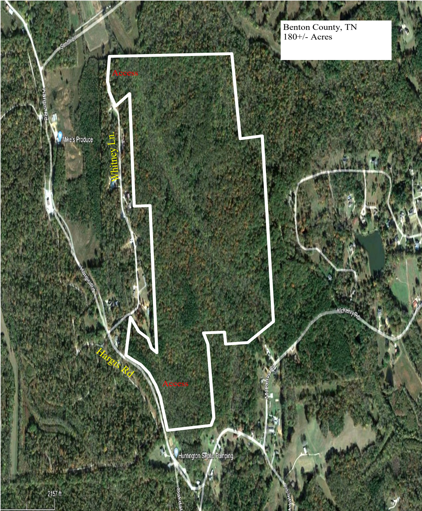
Property lines are approximate but not guaranteed