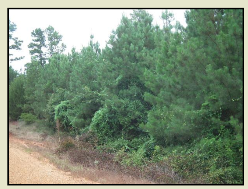
All information contained herein is supplied by sources deemed reliable, but is not guaranteed by Sartain's Heritage Properties, its Brokers or Agents. Properties are subject to errors, omissions, correction, price change, prior sale or withdrawal without notice. All Buyer's agents are required be identified on the first contact with Broker/Agents of Sartain's Heritage Properties and must accompany the buyer on showings to receive full fee participation. Otherwise, the fee participation shall be at the sole discretion of the Broker and Sartain's Heritage Properties.