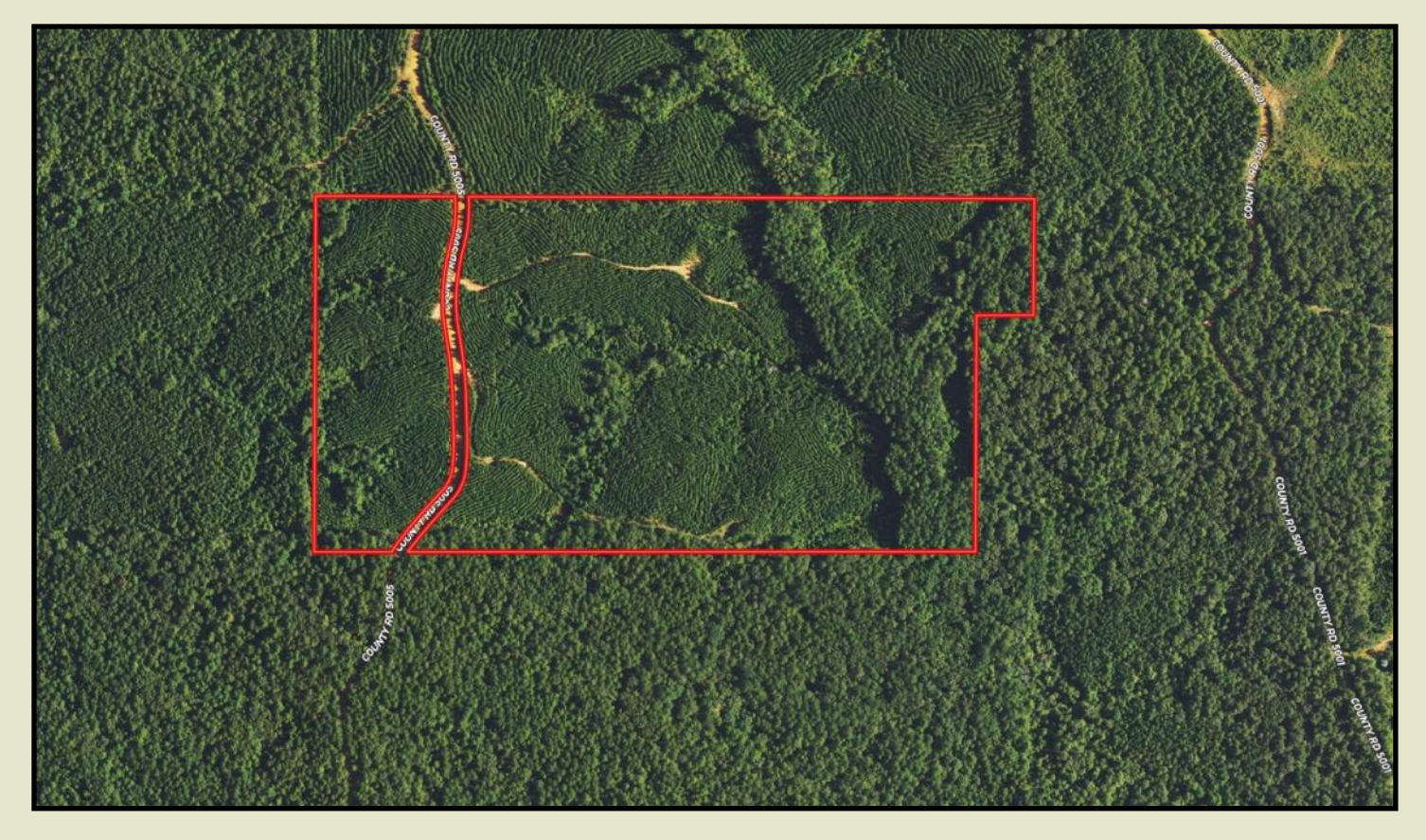
Jane Guyton offers a blend of natural features and strategic location. Here's a detailed overview:

Location: Situated in Section 34, Township 13 North, Range 9 East, Attala County, Mississippi, the property is conveniently located just west of Highway 25. It boasts frontage on two sides of gravel County Road 5005 and is approximately one and half miles south of Highway 19.