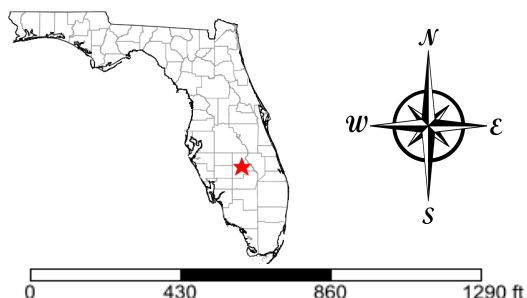
©2023 SVNIC. SVN | Saunders Ralston Dantzler Real Estate® is a registered trademark licensed to SVN Shared Value Network®. Any information displayed should be verified and is not guaranteed to be accurate by SVN Saunders Ralston Dantzler. You may not copy or use this material without written consent from SVN Saunders Ralston Dantzler.