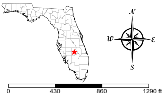
©2023 SVNIC. SVN | Saunders Ralston Dantzler Real Estate® is a registered trademark licensed to SVN Shared Value Network®. Any information displayed should be verified and is not guaranteed to be accurate by SVN Saunders Ralston Dantzler. You may not copy or use this material without written consent from SVN Saunders Ralston Dantzler.