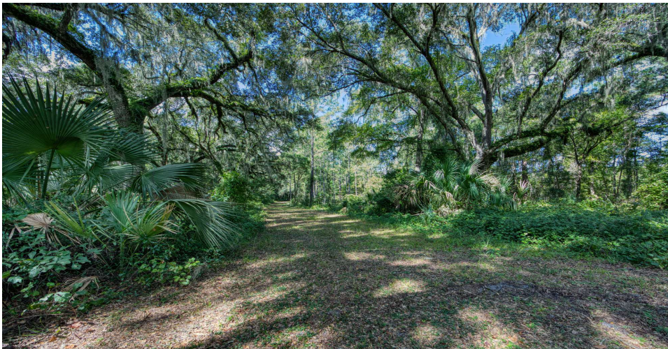
Entry to Riding Trail