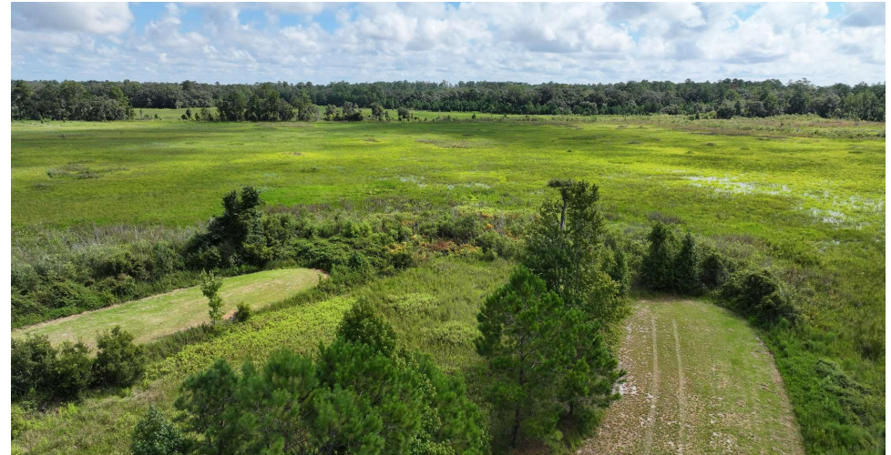
Clay Shooting Stations