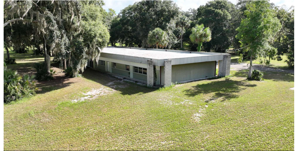
Aerial of Hangar