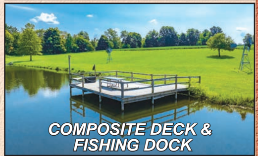
COMPOSITE DECK & FISHING DOCK