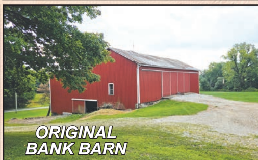
ORIGINAL BANK BARN