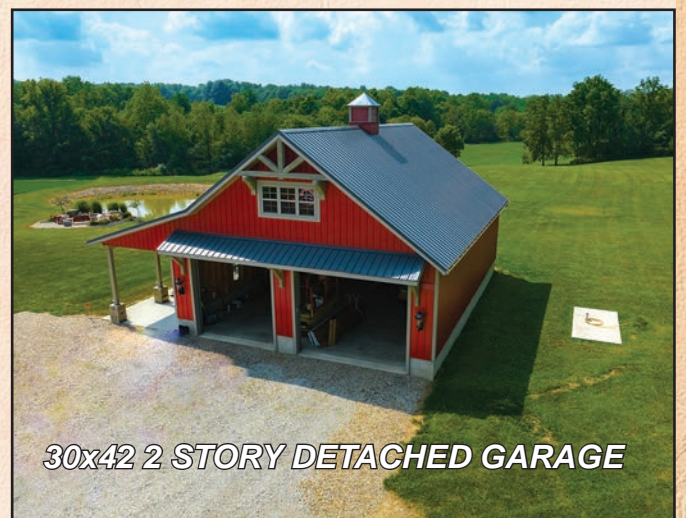
30x42 2 STORY DETACHED GARAGE

Don't miss your chance to own this remarkable property and experience the ultimate in privacy and luxury.