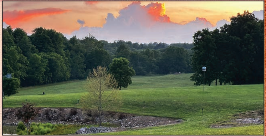
2 ACRE FULLY STOCKED LAKE W/SWIM BEACH