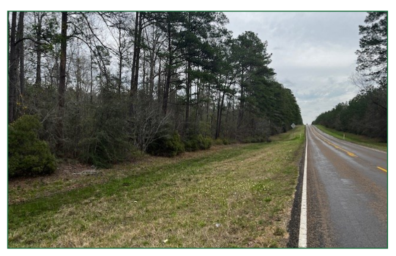
Hwy 83 runs along Rolling Hills Ranch tract #36.