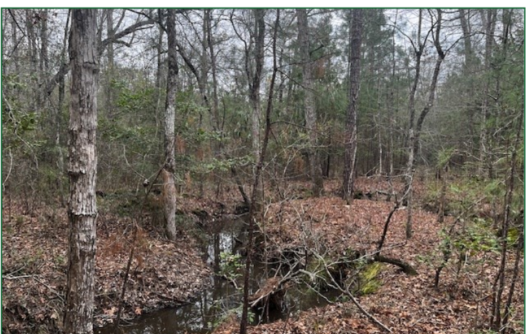
Meandering creek provides water for wildlife and picturesque setting for viewing.