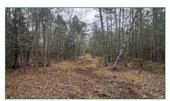
Mulched boundary lines marked with stakes.

The properties boundaries are mulched for easy identification in the field. The buyer shall do their own due diligence for all specifics.