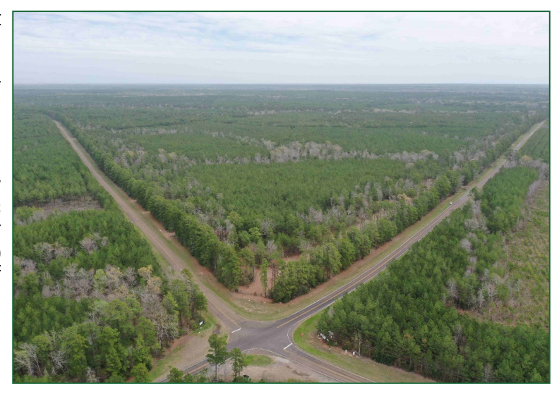
Aerial photo showing the corner of Hwy 83 towards Pineland and FM 1751 towards San Augustine.