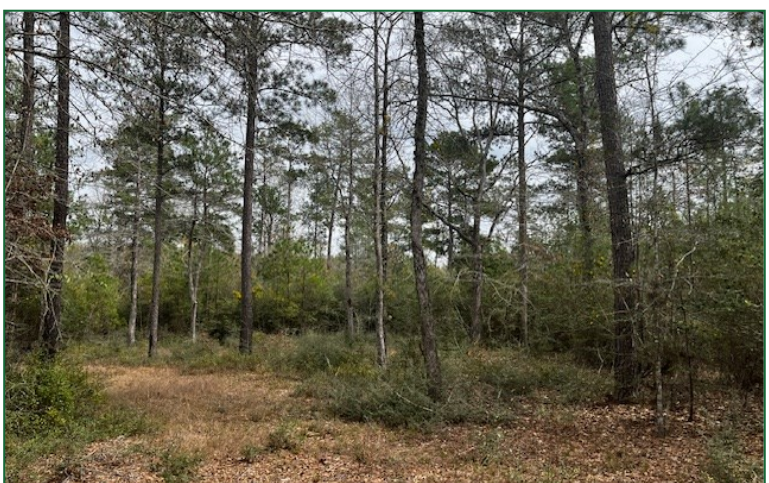
Area partially cleared for camping.