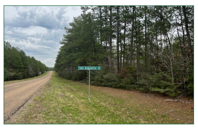
Frontage along FM 1751