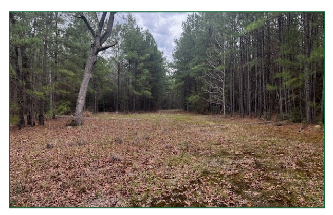
Mulched boundary lines marked with stakes.

The properties boundaries are mulched for easy identification in the field. The buyer shall do their own due diligence for all specifics.