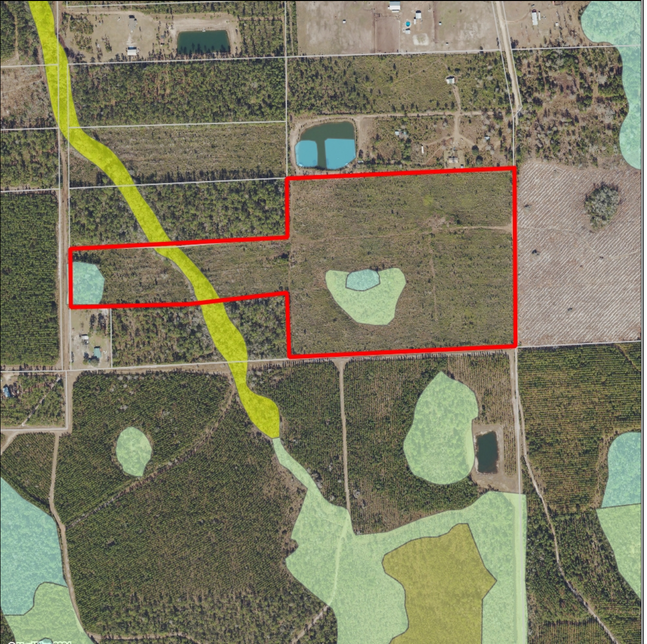
©2023 SVNIC. SVN | Saunders Ralston Dantzler Real Estate® is a registered trademark licensed to SVN Shared Value Network®. Any information displayed should be verified and is not guaranteed to be accurate by SVN Saunders Ralston Dantzler. You may not copy or use this material without written consent from SVN Saunders Ralston Dantzler.