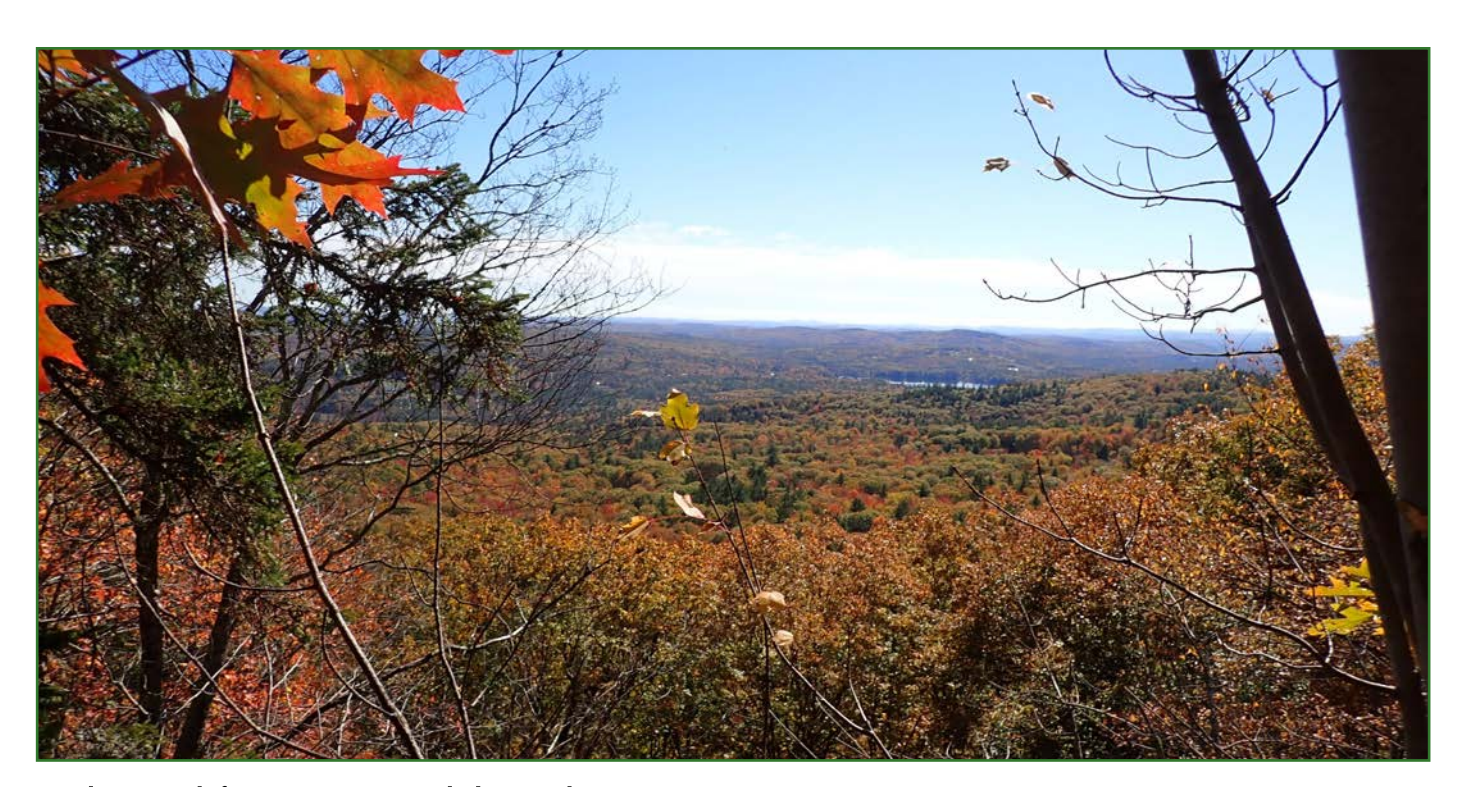
Looking south from vantage point below Tucker Mountain.

Fountains Land is the exclusive broker representing the seller's interest in the marketing, negotiating and sale of this property. Fountains has an ethical and legal obligation to show honesty and fairness to the buyer. The buyer may retain brokers to represent their interests. All measurements are given as a guide, and no liability can be accepted for any errors arising therefrom. No responsibility is taken for any other error, omission, or misstatement in these particulars, nor do they constitute an offer or a contract. We do not make or give, whether in these particulars, during negotiations or otherwise, any representation or warranty in relation to the property.