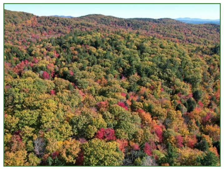
White Pine makes up a portion of the species.