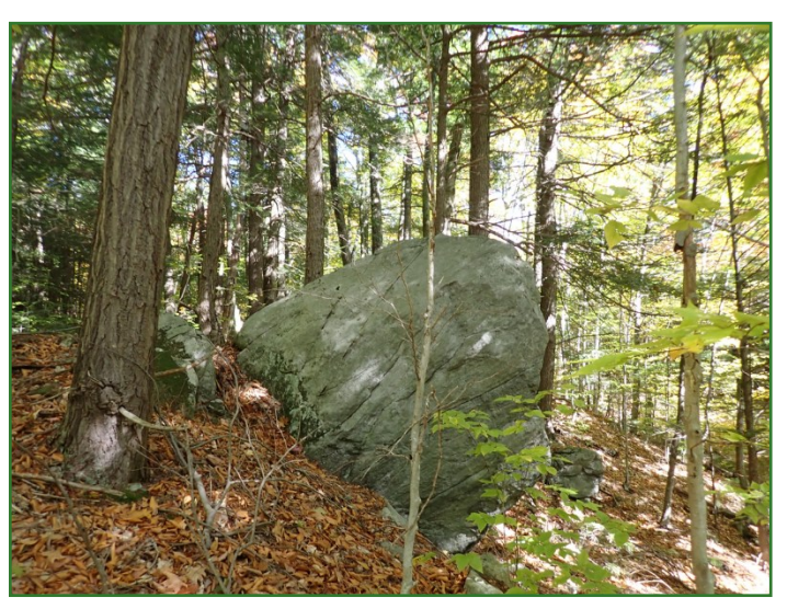
Numerous glacial erratics accent the landscape.