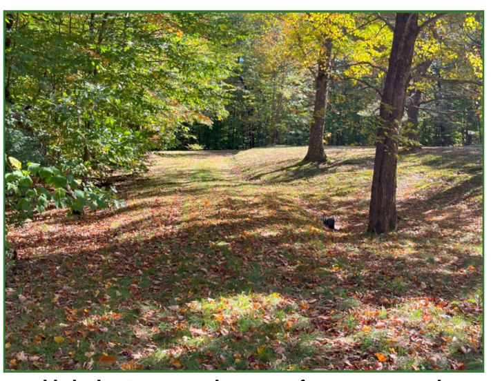
Established R.O.W. provides access from Pieters Road.

Thinning to improve forest health and growth can occur at any time. The property is well poised for a harvest, which could provide immediate cash flow upon purchase. A forest management plan and timber inventory were performed in April 2024. A copy is available upon request. The oak component provides mast for the local wildlife population. Evidence of deer and bear exist throughout the property.