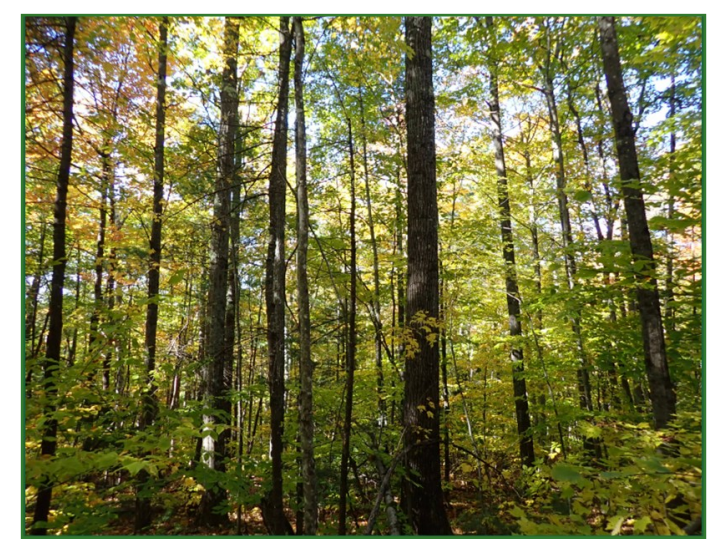
Hardwood sawtimber poised for future growth.

Municipal property taxes are approximately $195 per year. The maps in this report are based on the forest management plan map. Further information regarding the title can be found in the Merrimack County Records Book 1267, Page 432. The property is enrolled in New Hampshire's Current Use, keeping the annual property taxes very low.