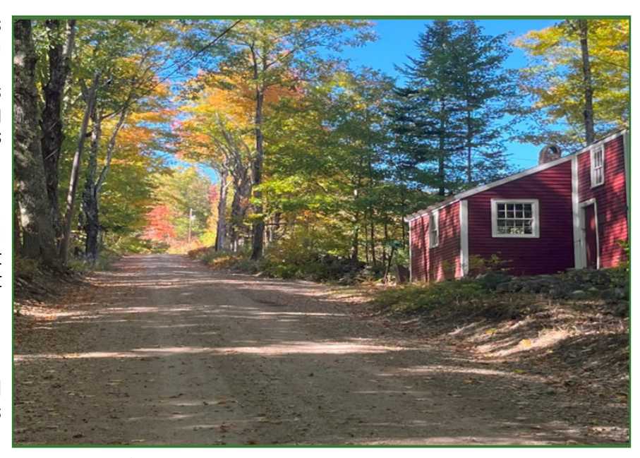
The junction for Tucker Road and Pieters Road is marked by a red school-house that is on the National Register of Historical Places.

buyers should have these documents reviewed by their legal counsel. Internal woods trails cover most of the land's extremes. Boundaries exist as stone walls, wire fencing, and new blazes.