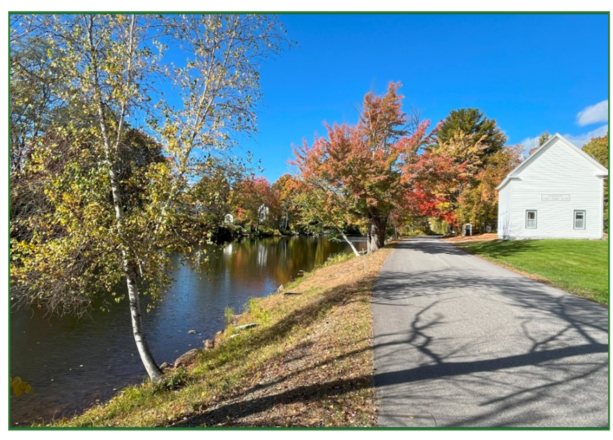
The East Andover is a picturesque New England town that affords ample opportunities for outdoor recreational activities.

Based upon a review of legal documents, the right of way appears to provide permanent, unrestricted access for ingress and egress to the land. These legal documents are available upon request. Prior to making an offer to purchase the land,