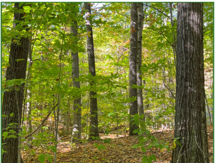
Mature Red Oak is found throughout the property.