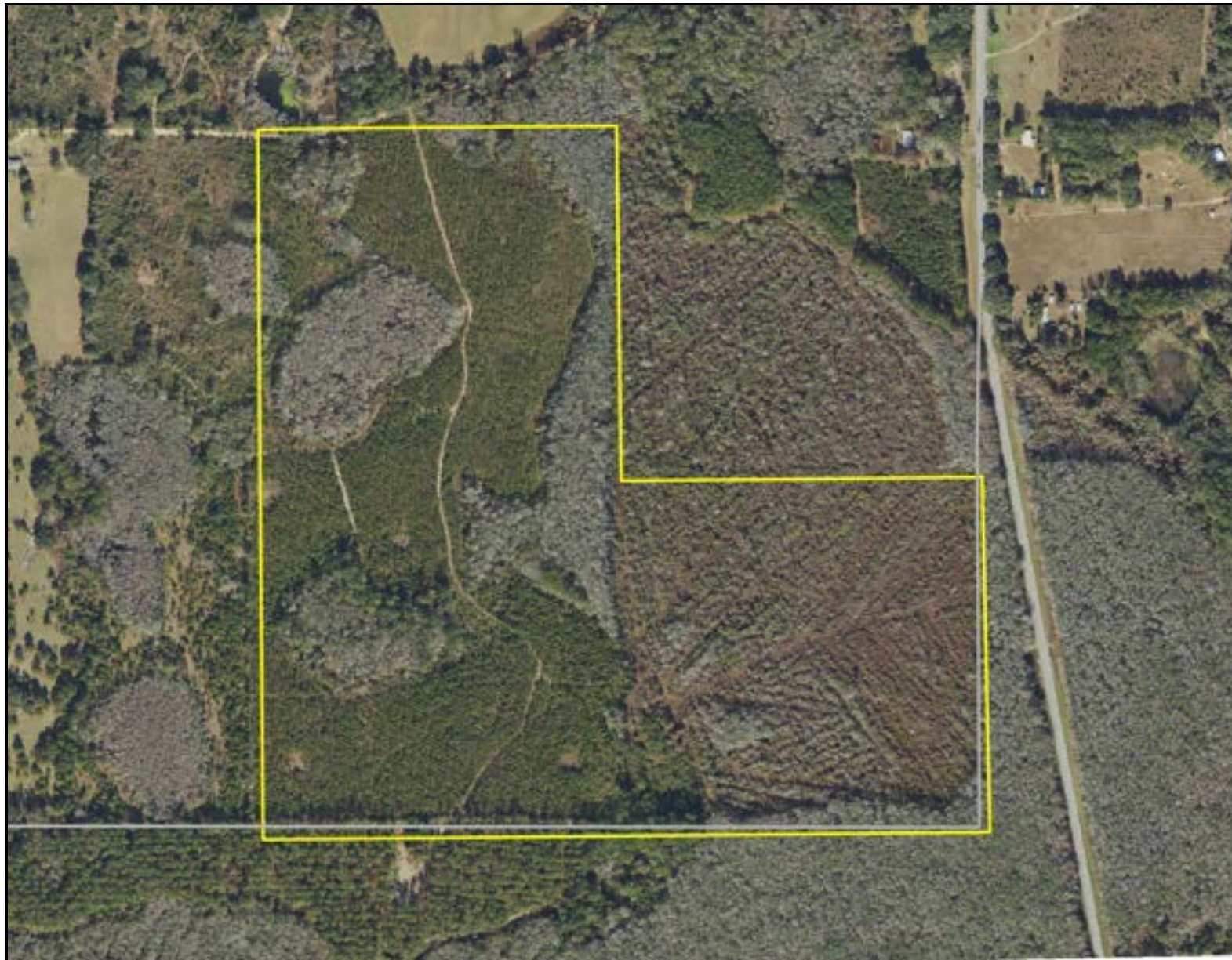
East Boundary Map