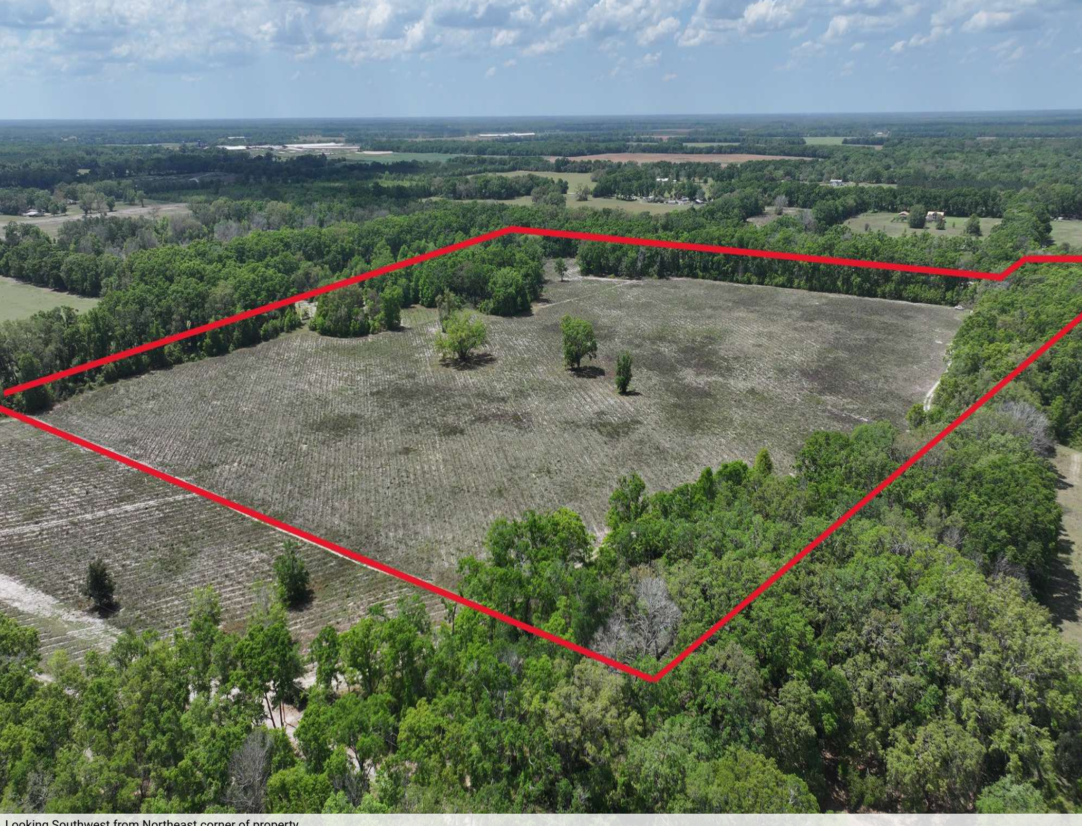
Looking Southwest from Northeast corner of property