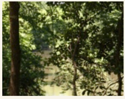
See Reverse for Maps